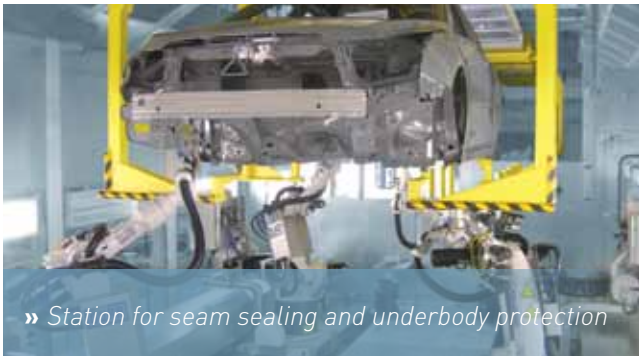
» Station for seam sealing and underbody protection