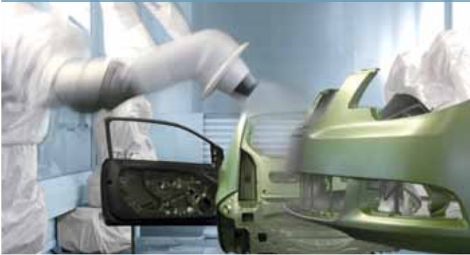
» Painting booth in the Ecopaint Test Center Paint