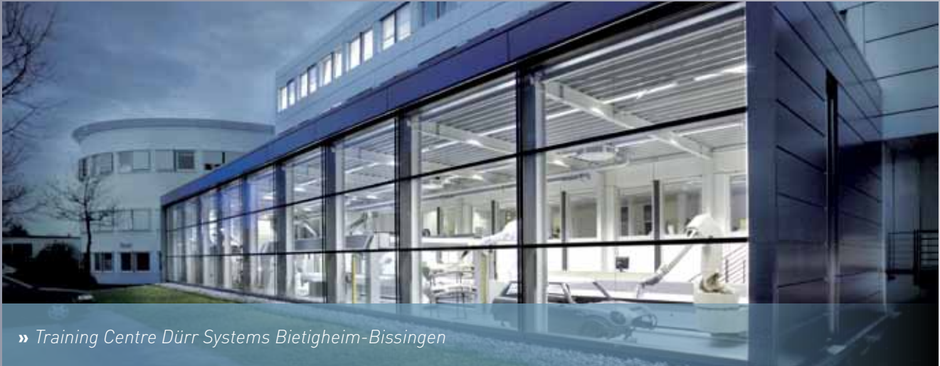
» Training Centre Dürr Systems Bietigheim-Bissingen

Dürr's best support increases your plants' availability. Our service offers short times to reaction and comprehensive technical competence.