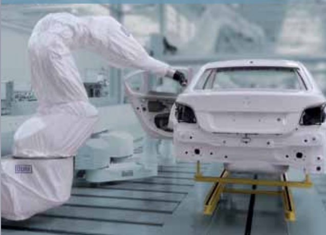
» Painting robots, door and hood opener, traveling axis